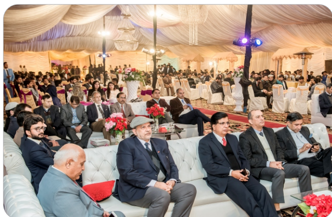
DVM Annual Dinner 2019