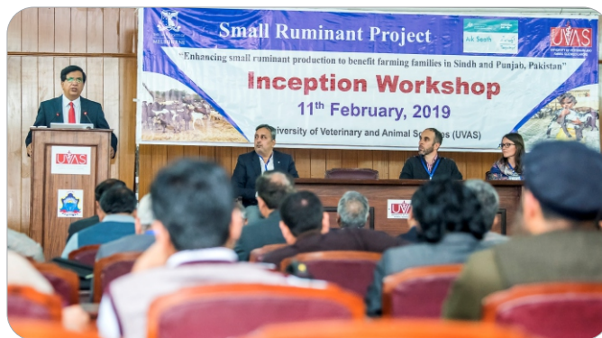
Small Ruminant Project Inception Workshop.