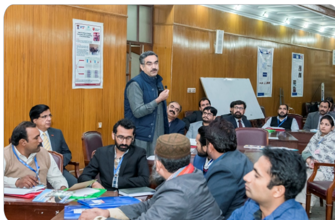
Dairy - Beef Project Extension Workshop