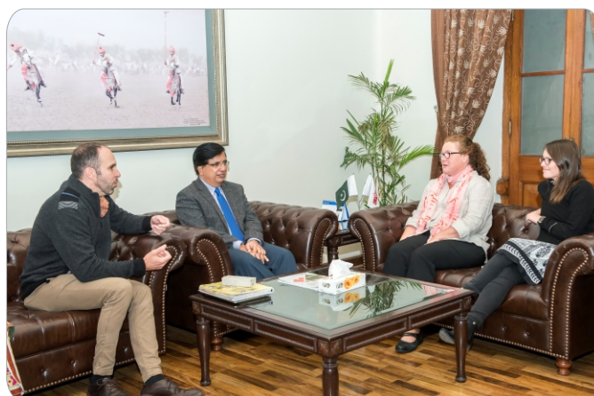
Australian delegates meet Vice-Chancellor.