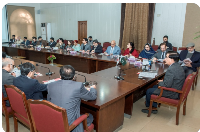
50th Meeting of Advance Studies & Research Board.