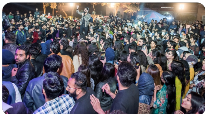
An aqua fire music gala at UVAS.