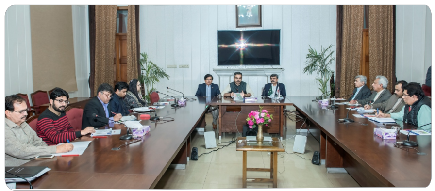
A meeting on livestock development at the UVAS Syndicate Room.