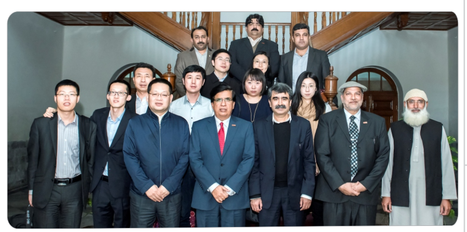
A Chinese experts delegation with the Vice-Chancellor.