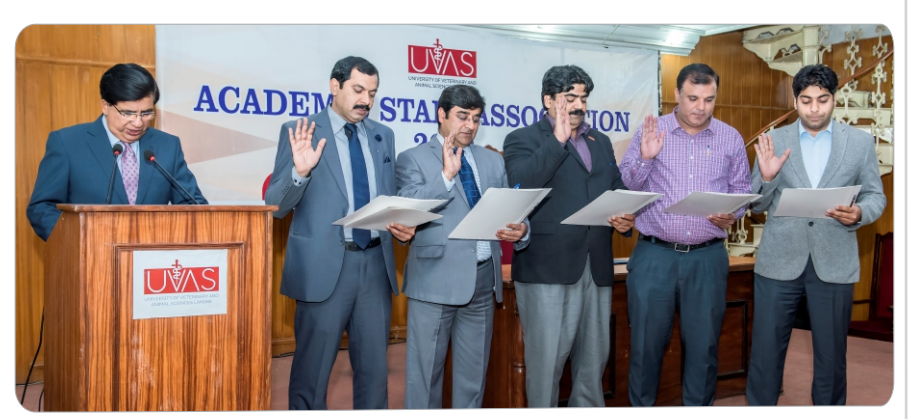
The Vice-Chancllor administers oath to the office-bearers of Teaching Staff Association.