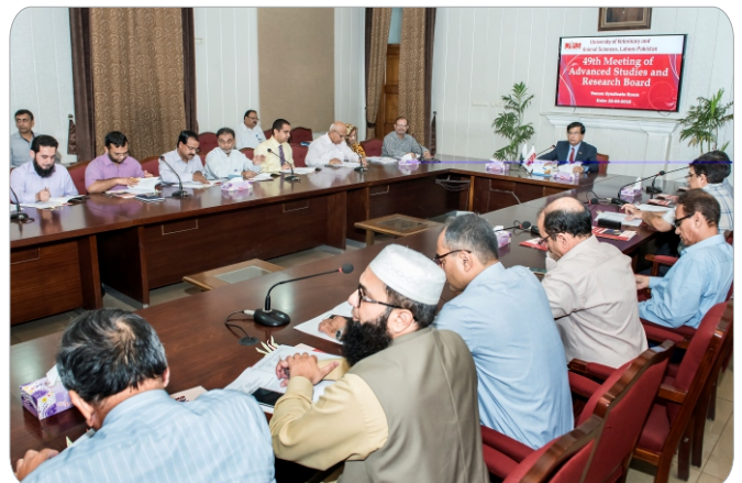
The Vice-Chancellor chairs 49th meeting of Advanced Studies and Research Board.