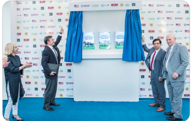
Herd books for Nachi, Beatal and Lohi being unveiled.