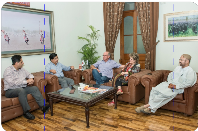
A South African delegation calls on the Vice-Chancellor.