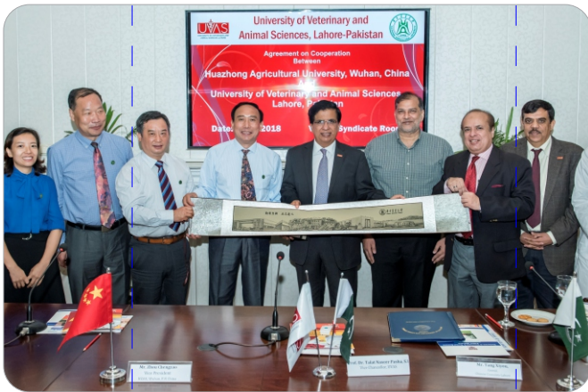
Huazhong Agricultural University delegates present a souvenir to Vice-Chancellor.