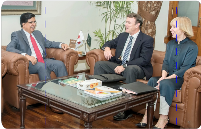
The Vice-Chancellor in a meeting with a US delegation.