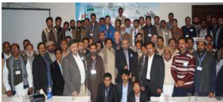
Group Photograph with participants at seminar in collaboration with Tawakkal Tilapia Hatchery and Oryza Feeds dated January 06, 2016, Ramada Hotel, Multan