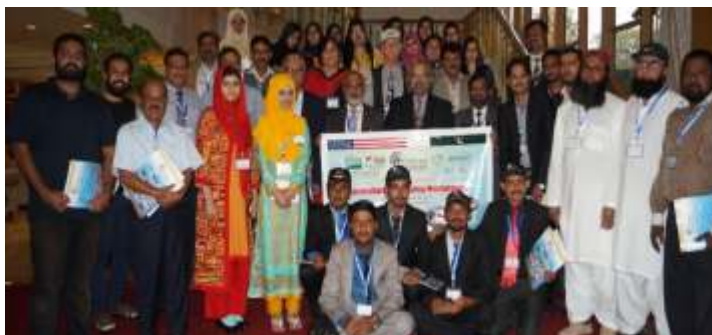
Group Photograph with participants at seminar in collaboration of Fisheries Development Board and Sindh Fisheries Department, dated January 04, 2016, Marriott Hotel - Karachi